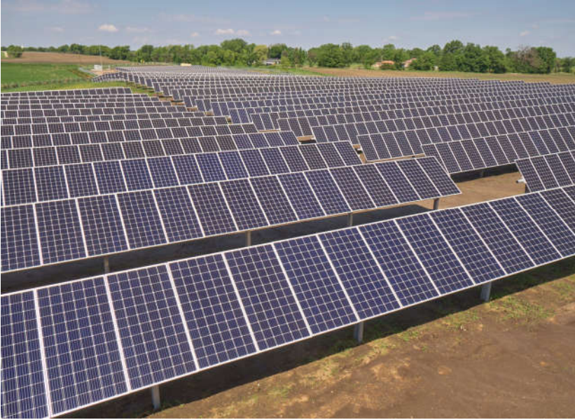
Minnesota Municipal Power Agency's 7 MW Buffalo Solar Buffalo, MN