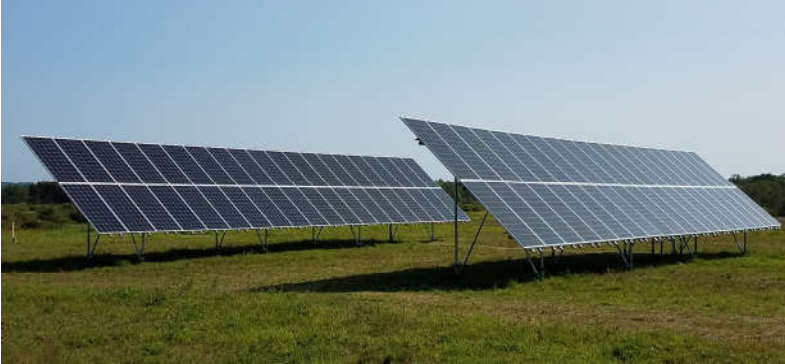
Detroit Lakes Public Utility's 29.3 kW Select Solar Community Solar Garden Detroit Lakes, MN